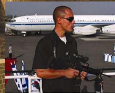
A friendly face